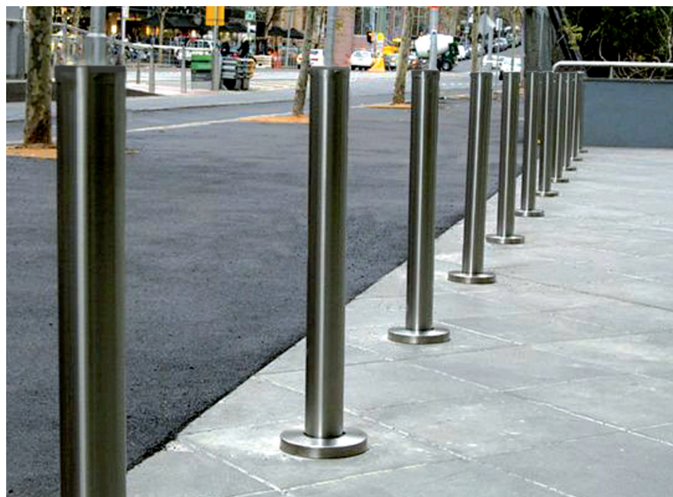
C90SM-SS10 with optional base cover COV90-SS.