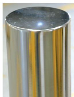
Welded and polished flat cap.